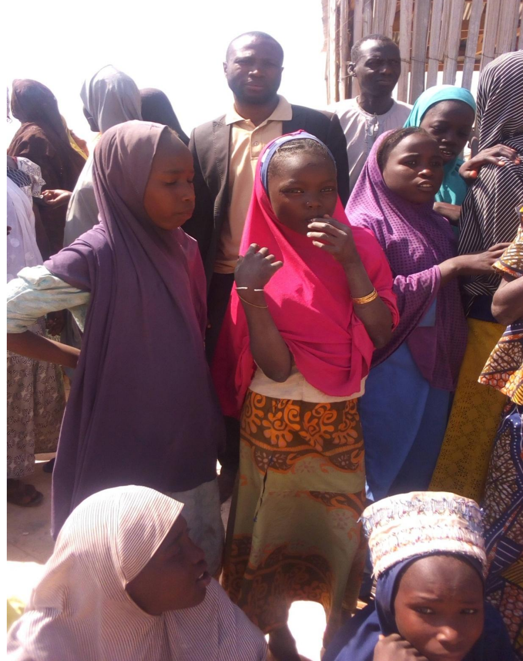
Plate 1: Children during break time in a school at Gubio Road Camp

Plate 1 shows the children during break at Gubio Road Camp. The picture depicts that some of the children are on mufti and do not have uniforms. During the break time, the students are seen playing.